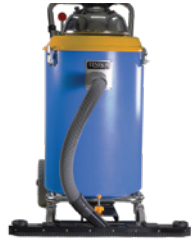
26" Front Mount Squeegee