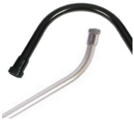
Wands (Various Shapes & Lengths)