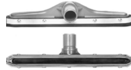
Liquid Pick-up Tools