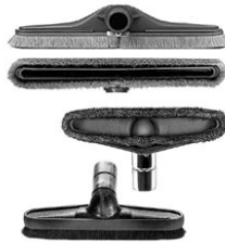
Smooth Surface Tools